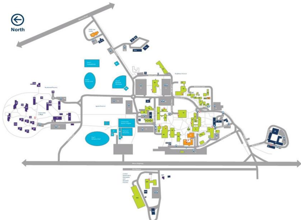
Figure 1 Site Location