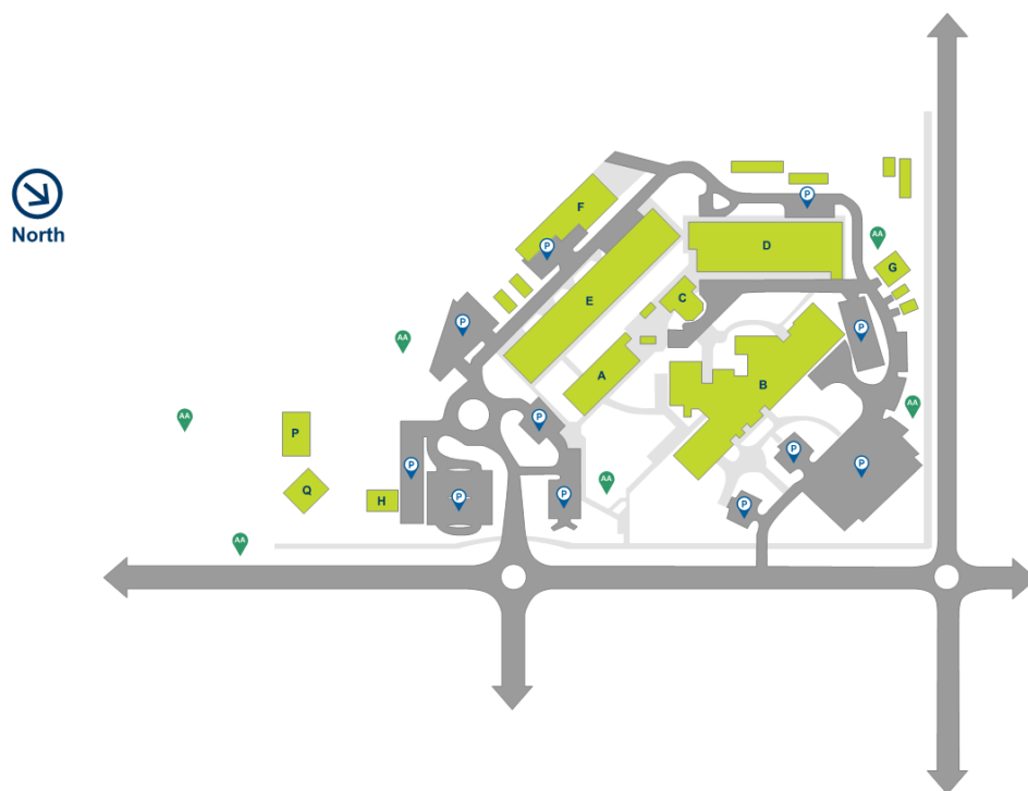
Figure 1 Site Location