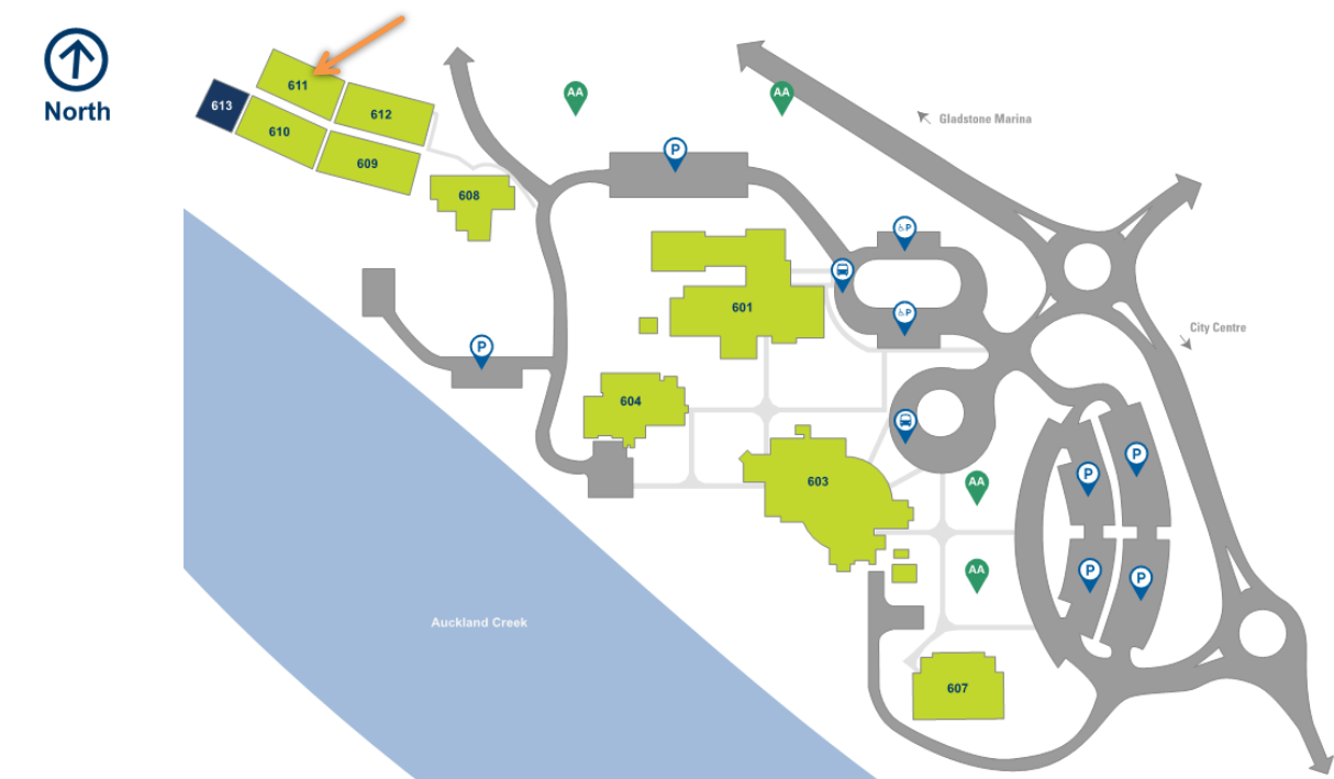
Figure 1 Site Location