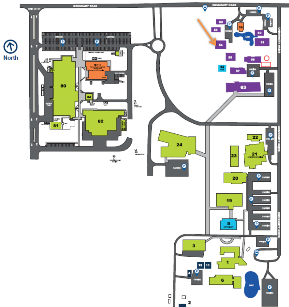
Figure 1 Site Location