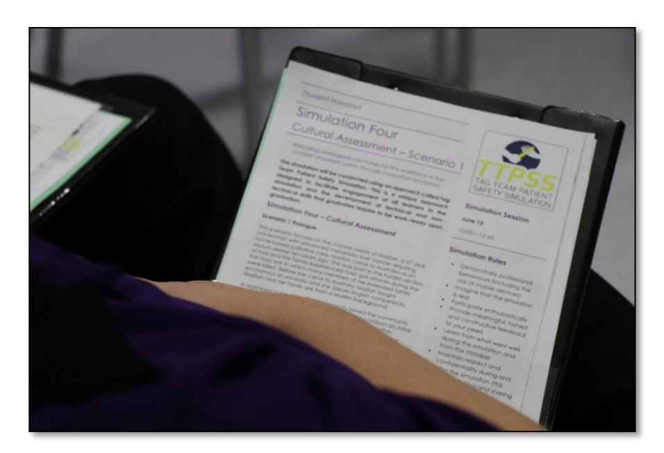
Preparatory reading materials

The TTPSS toolkit includes a modifiable template where the details of dates, times, and venue can be inserted (see Appendix 4).