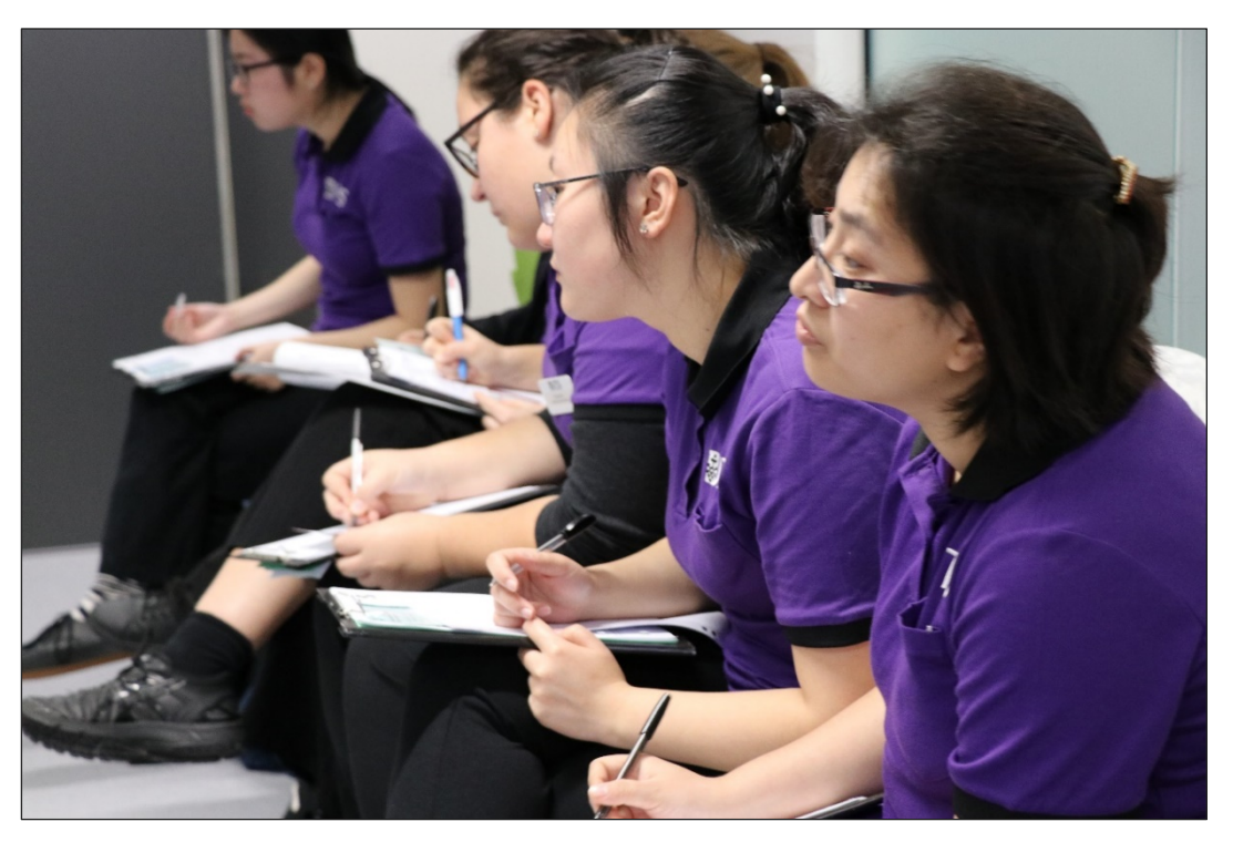
Audience members observing the simulation and taking notes so that they are prepared to provide meaningful feedback during Intermission and Debrief

You are required to observe the simulation and take notes as required. During the Intermission and Debrief you will be expected to provide feedback on specific aspects of the unfolding scenario. The focus of your feedback is on the Cue Card provided and related to the NQSHS Standards. Feedback should be constructive, supportive and focused on enhancing safe nursing practice.