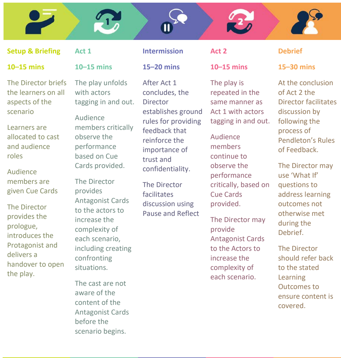
Figure 3 TTPSS Structure

Each scenario incorporates five phases: Setup and Briefing, Act 1, Intermission, Act 2, Debrief (see Figure 3). Whilst notional times are suggested below, the amount of time spent in each phase will be dependent on the cohort and the level of complexity introduced by the facilitator.