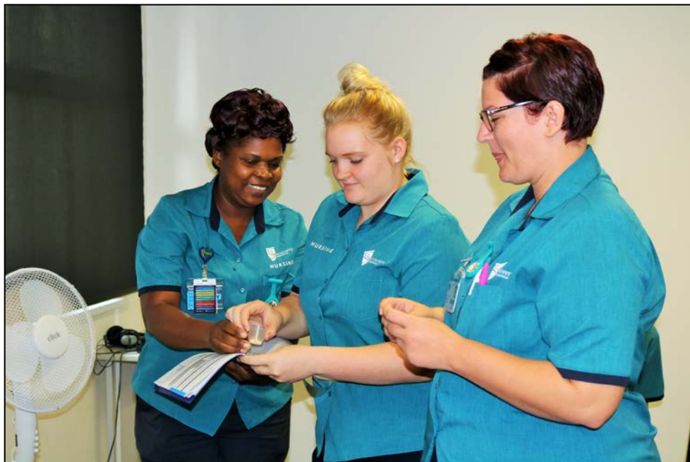
Nursing students performing a medication check