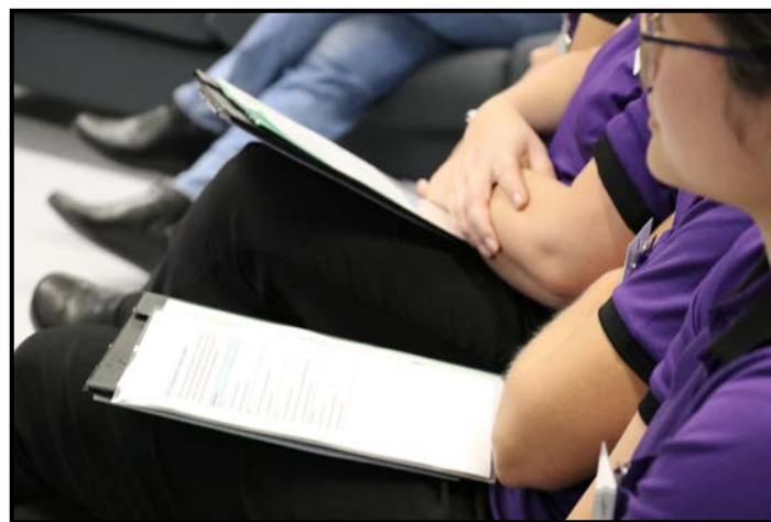
Knowledge acquisition test

The KAT consists of 10 multiple choice questions related to the learning outcomes for the specific simulation and designed to test recall and application of information. The KAT is provided to learners before their simulation experience and following Debrief. An independent t -test can be used to determine whether there are statistically significant differences pre- and post-simulation.