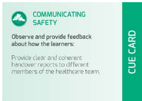
Example Cue Card

There are two types of cards that are used in TTPSS, Cue Cards and Antagonist Cards (see examples below). They are colour coded to correspond with the NSQHS Standards, and depending on the scenario chosen, instigate varying levels of complexity. Cue Cards are given to the audience members by the Director before the commencement of the play and provide key focus points for learners to consider during the scenario. Cue Cards also guide audience members' feedback during the Intermission and Debrief.