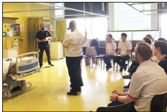
Preparing the learners