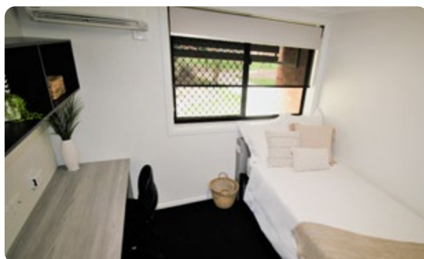
McCall Air Con Room, Capricornia College.