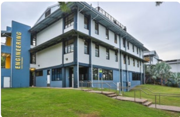
Engineering precinct and allied health clinics.