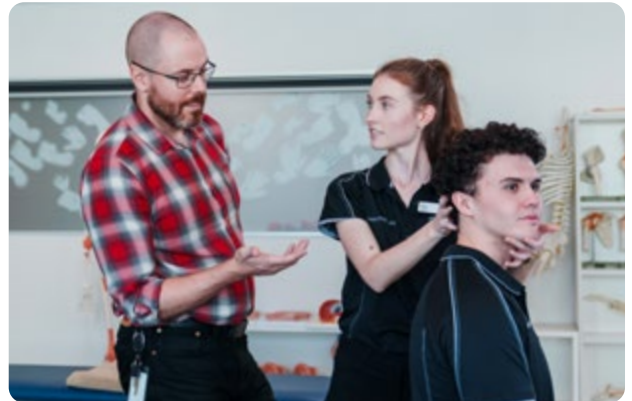
Clinical learning experiences.