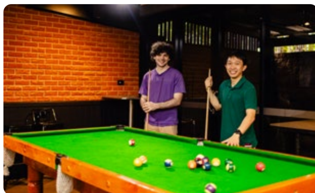
JCR Room, Capricornia College.