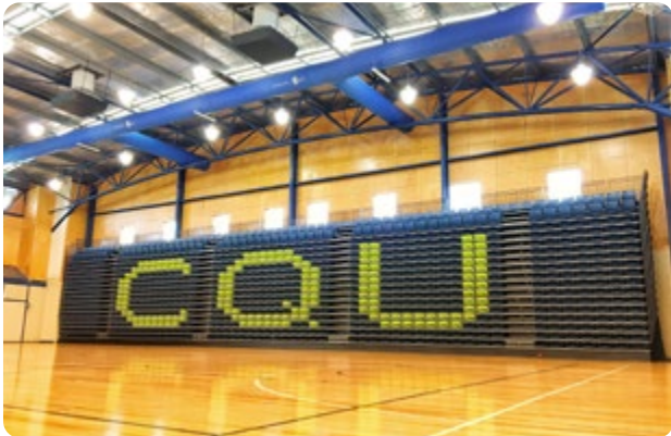
Sports centre, outdoor courts and gyms.

Our campuses feature modern, state-of-the-art teaching and learning facilities with well-equipped study areas as well as recreational spaces to socialise.