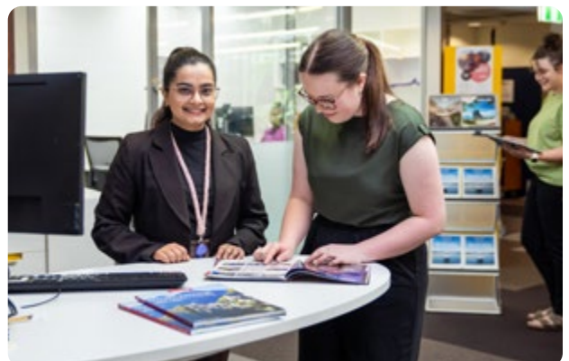
Fully equipped libraries and study hubs.