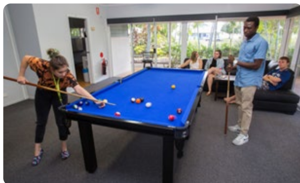
Area 51 Common Room, Canefield College.