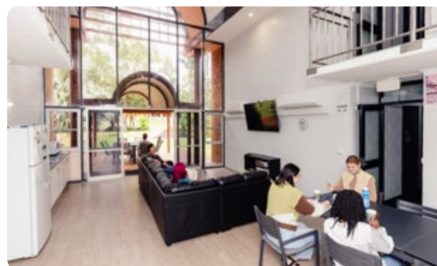
Gutery House, Capricornia College.

Renting an apartment or a house with housemates is ideal for meeting new people and reducing your costs. If you decide to live alone, you will have to pay for all costs. Rentals come either furnished or unfurnished and you can find these through property websites such as realestate.com.au and domain.com.au .