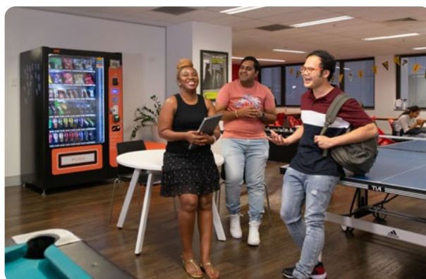
Social spaces, lounges and cafés.