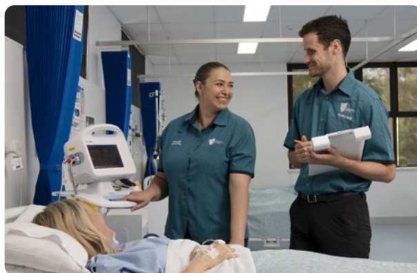
Clinical learning experiences.