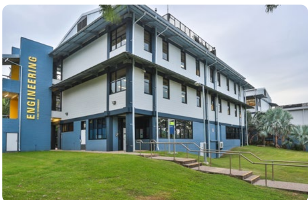
Engineering precinct and allied health clinics.