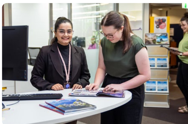
Fully equipped libraries and study hubs.