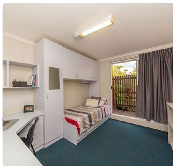
Hopkins Standard Room, Rockhampton.

Rental properties such as flats, houses and shared accommodation are also available. We recommend visiting realestate.com.au and domain.com.au .