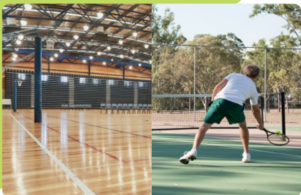
Sports centre, outdoor courts and gyms.

Our campuses feature modern, state-of-the-art teaching and learning facilities, complete with well-equipped study areas and recreational spaces to socialise.