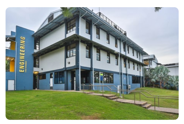
Engineering precinct and allied health clinics.