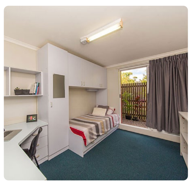
Hopkins Standard Room, Rockhampton.

Rental properties such as flats, houses and shared accommodation are also available. We recommend visiting realestate.com.au and domain.com.au.