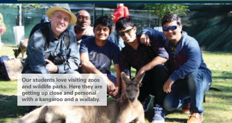
Our students love visiting zoos and wildlife parks. Here they are getting up close and personal with a kangaroo and a wallaby.