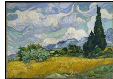
Figure 4. Van Gogh's distinctive brushwork in Wheat Field with Cypresses , 1889.